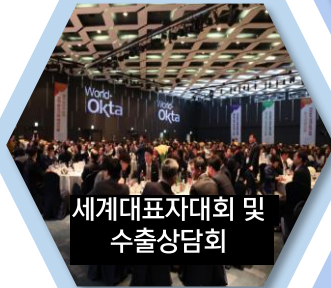
세계대표자대회 및 수출상담회