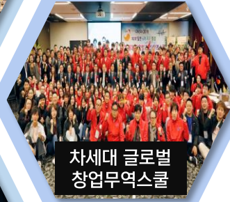
차세대 글로벌 창업무역스쿨